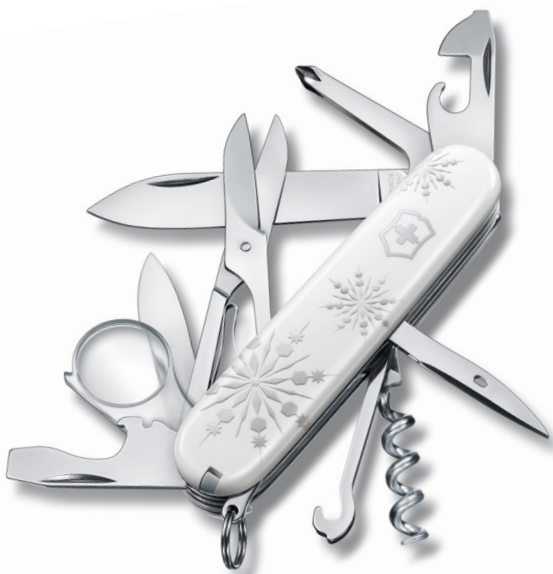
1.6703.77 Explorer White Christmas Special Edition 2017

tors. Thanks to its many functions, it will always provide pleasure. White as the scales is also the gift box, which at the front and back allow an insight to the pocket knife. Our tip – make the Explorer «White Christmas» a present hanging on the Christmas tree and family and friends will be thrilled by this great surprise. Merry Christmas!