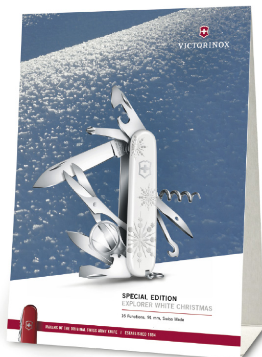
X.90323.16 A5 counter display