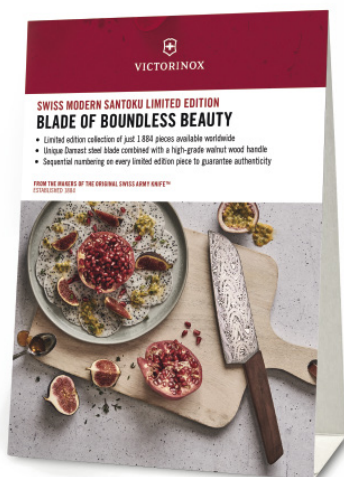
X.90323.35 A5 counter display