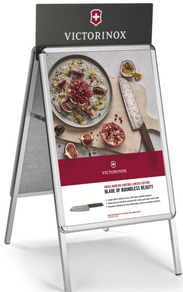
X.90181.46 A1 poster